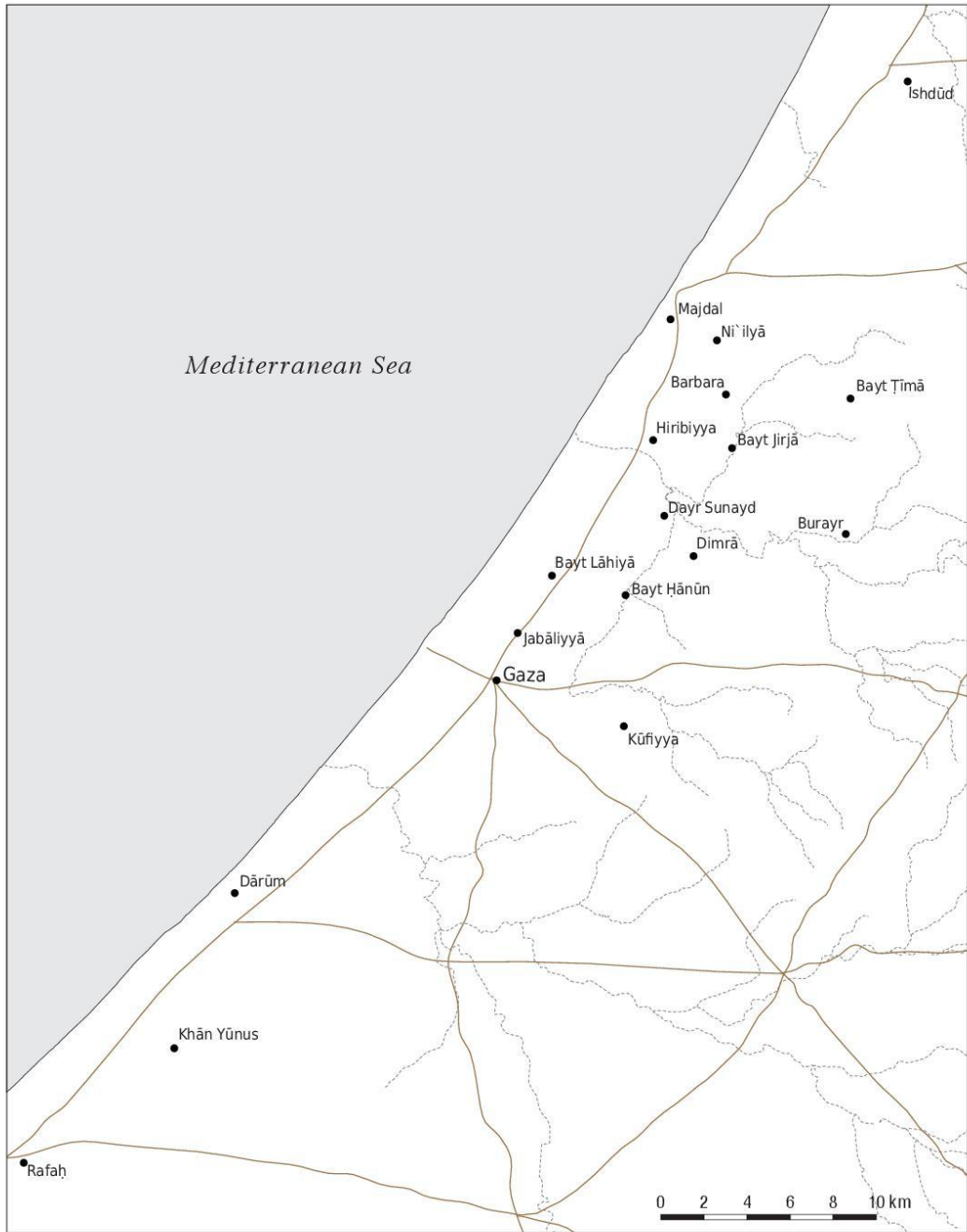
Map no 2